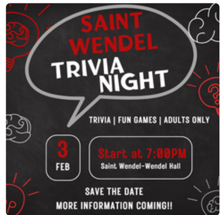
Saint Wendel Trivia Night Save the Date