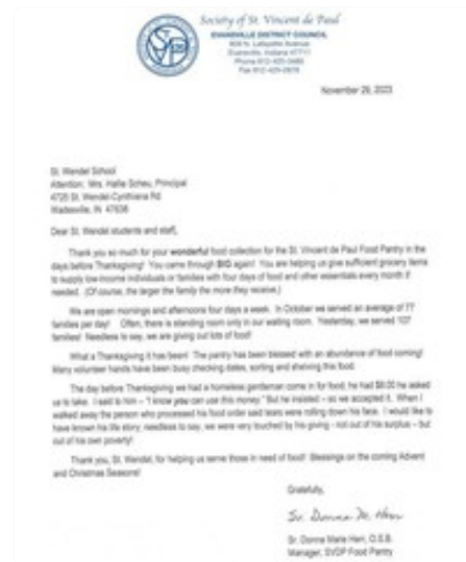
Letter From St. Vincent De Paul Food Bank