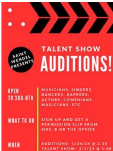
Saint Wendel Talent Show Information