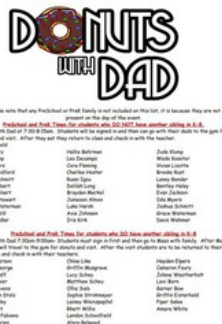
Donuts with Dad PreSchool/PreK Information