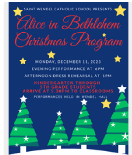
K-5 Christmas Program Flyer