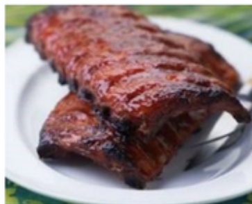
Dewig Meat prepared by Double Z Smokers

Kids Menu: Hotdog, macaroni & cheese, applesauce, dessert & drink.